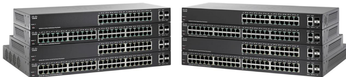
Figure 1. Cisco 220 Series Sw itches

For businesses requiring high performance, security, and manageability from network switches, fully managed switches are an excellent choice. However, they also typically come with high price tags. Smart switches are lower-priced alternatives, but performance and features are usually sacrificed. Cisco® 220 Series Smart Switches (see Figure 1) bridge the gap between managed and smart switches to offer you the best of both worlds. They provide the higher levels of security, management, and scalability that you expect from managed switches, while maintaining the affordability of smart switches.